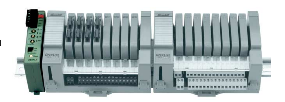
OPENLT® UNIT ON OPENDAC® SYSTEM